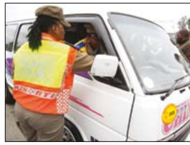
A traffic law enforcement officer at work.

T HE Provincial government is enjoying the fruits of its wisdom in bringing together two departments namely, Community Safety and Transport, as public transport operations in KwaZulu-Natal are no longer subjected to endless disruptions caused by instability in the taxi industry. In an on-going effort to police often unnecessary disruptions, disturbances and confrontations in public transport, particularly in the taxi industry, provincial government resolved to amalgamate the two portfolios so that it would