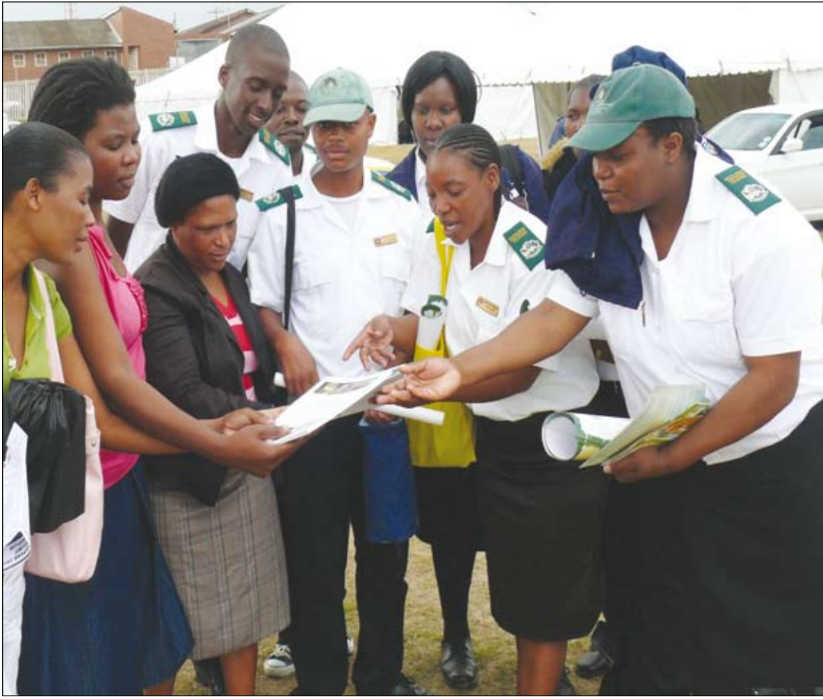
Social Crime Prevention Volunteers are prepared to go all out in the spirit of Batho Pele, as demonstrated by their willingness to avail and explain their services to members of the community.